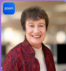
Prof. Christina Maslach